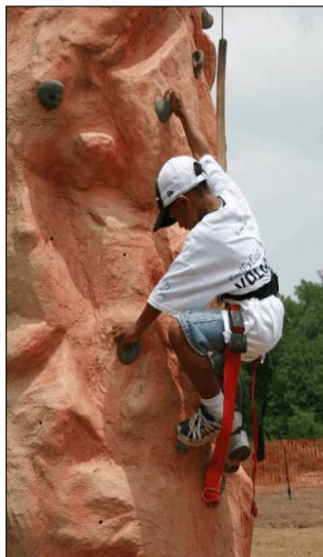
A participant from Washington, D.C. climbs a rock wall for the first time.

The fourth annual GO Day featured over 117 official sites in 36 states. Collectively, these sites welcomed almost 40,000 new faces to the joys and benefits of the Great Outdoors. GO Day