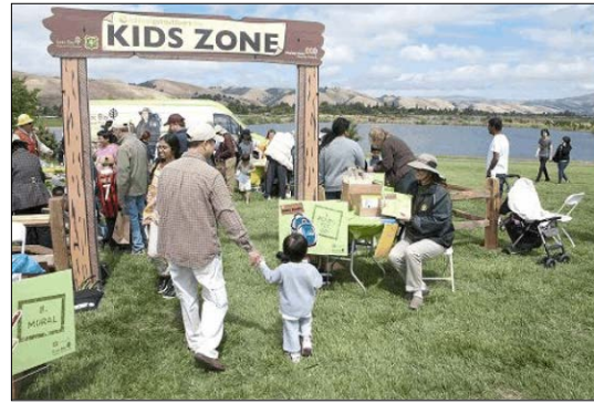
The Fremont, California was a huge success, attracting over 2,000 participants from the San Francisco Bay area.

GO Day activities at all of the sites provided introductions to active outdoor recreation opportunities as well as education. The activities ranged from recycling education, fishing education, and water safety, to casting technique, archery, hayrides, and fishing. Children participated in canoeing, nature walks, geocaching, high rope adventures, rock climbing, and mountain biking, and checked out environmental/ conservation education stations and camping demonstrations. Children participated in fire-fighting activities with a fire engine and associated equipment, and played outdoor games like jump roping, hula hoops and hopscotch. There was disc golf and model boat sailing, nature art, drawing, face painting as well as wildlife education featuring live animals. Joe Reilly, environmental educator and the official GO Day Troubadour, performed live in Ann Arbor, Michigan, and his song "Let's Go Outside" was played at locations across the country. A USDA People's Garden was installed by GO Day participants on Kingman Island in Washington, D.C. Information on the Presidential Active Lifestyle Award (PALA) was distributed to hundreds of children in the hopes of encouraging them to commit to regular physical activity. And many sites provided photo opportunities and a chance for children to interact with characters like Smokey Bear, Woodsy Owl, Bobber the Water Safety Dog and other interesting costumed characters.