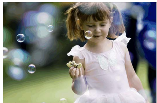
A young girl enjoys the outdoors in Salt Lake City, Utah.

events across the country helped support the First Lady's Let's Move Outside initiative, which seeks to eliminate childhood obesity within one generation by promoting healthy outdoor activity. Official GO Day sites across the nation included signature sites in Denver, Vancouver, Mesa (Arizona), San Bernardino (California), Apple Valley (Minnesota), Salt Lake City, Milwaukee, and Washington, D.C., and welcomed tens of thousands of new faces to the Great Outdoors.