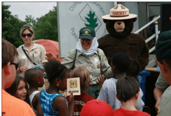
Smokey Bear helps the U.S. Forest Service swear in Junior Rangers in Washington, D.C.

Some sites featured areas that focused on other aspects of healthy living, including sustainability, good nutrition and outdoor ethics. Overall, the goal was to ensure that the fun and excitement of GO Day triggered a resolution for participants to make getting outdoors part of their everyday lives.